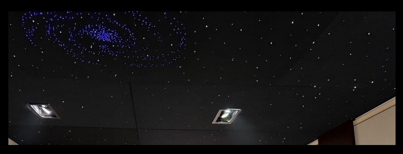
fiberoptic ceiling panels with galaxy design